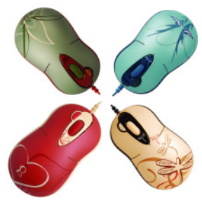
Mini Optical or G-Laser Mice