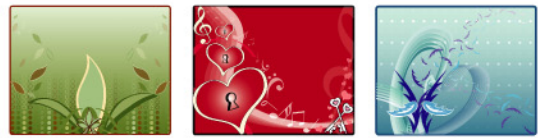
Laptop Skin and Mouse Pads